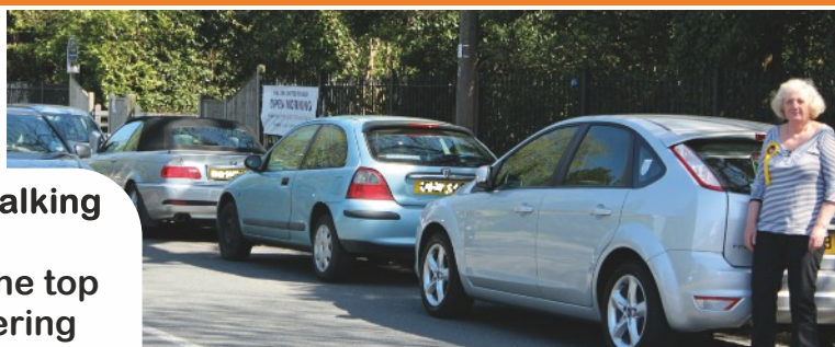
Keymer Road at the Junction of Oak Hall Park.

Now due for improved T.R.O. to help road safety after years of campaigning by Sue and residents.